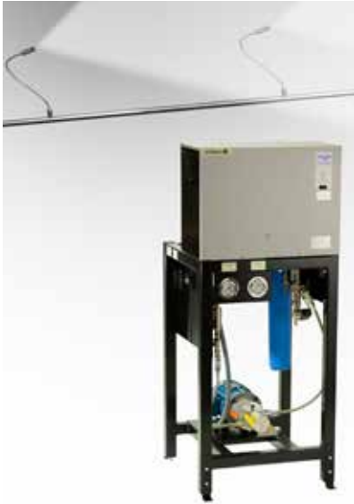
The DriSteem High-Pressure System delivers evaporative cooling and humidification to multiple zones in air handlers, ducts, and open spaces. The Vaporlogic controller provides comprehensive management of all system variables.

The High-Pressure System provides ultra-pure water that leaves no white dust when used with water treatment options available from DriSteem.